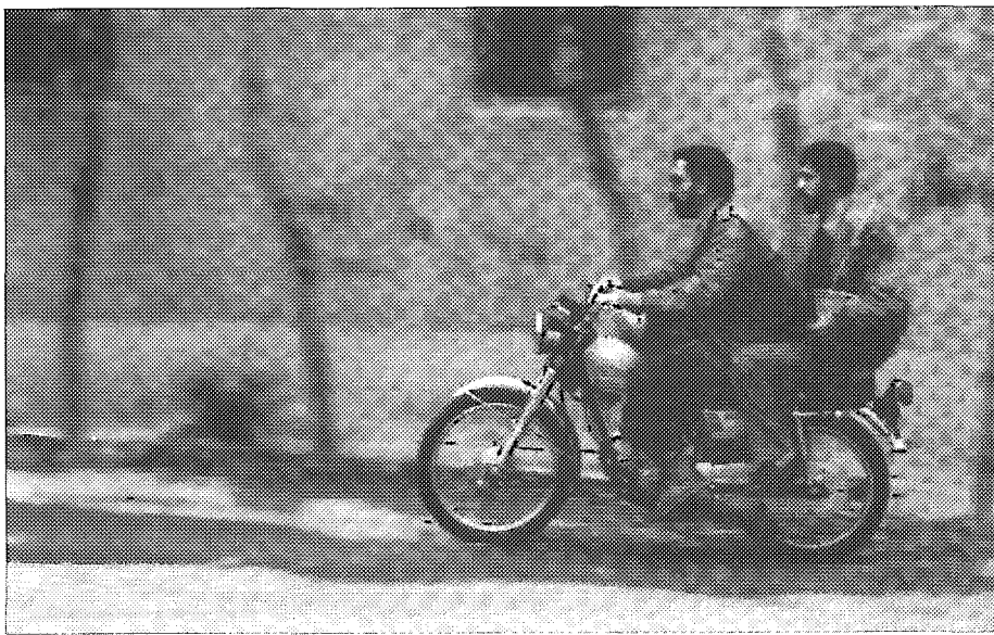
Abbas Kiarostami's Close Up (1990) utilizes a quasidocumentary approach to tell the true-life story of an obsessed Iranian film buff.

impossible to make Ten without the two little cameras mounted on the car's dashboard. With no directorial mediation, the hidden cameras voyeuristically capture intense confrontational dialogs about life in contemporary Tehran. But the ambiguity this technology elicits between document and fiction is not merely a strategy for arriving indirectly at a political argument in a censoring national climate—after all, Mania speaks fearlessly about the difficulties of being a woman in Tehran.